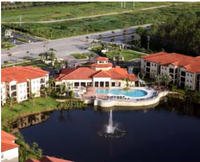
Unit photos pending

$1900/mo 2 nd floor 1/1 pool-side lake view W exposure, turnkey. No-smoking, No-pet unit. Stainless steel appliances. Rent includes: Water/Sewer, County Trash Collection, local ph/cable/internet. Min. lease 6 mos to 9mos max. Available 2/1/12