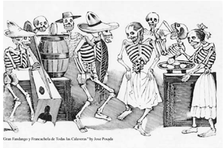
Gran Fandango y Francachela de Todas las Calaveras™ by Jose Posada

Don't miss a day full of tradition and remembrance.