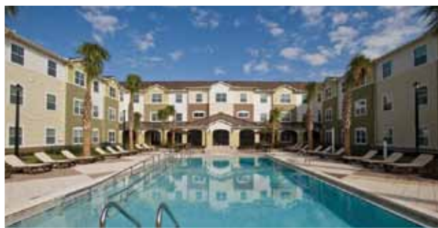
Beautiful pool area

Due to the tremendous success of Marcis Pointe, Vestcor is looking for more affordable senior communities to expand our portfolio.