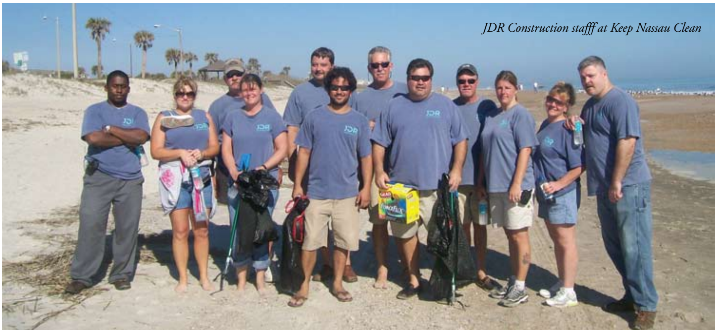
JDR Construction staff at Keep Nassau Clean