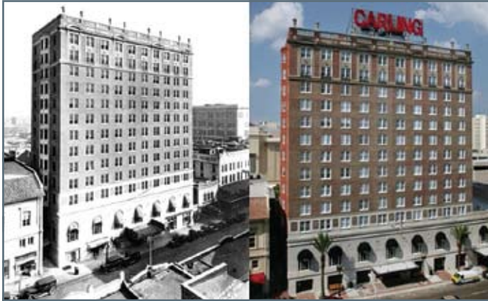
The Carling – Then & Now

The Vestcor Companies hosted 50 commercial real estate brokers at The Carling for a luncheon held on October 17, 2007. After lunch, the brokers toured nearly 18,000 square feet of commercial space that is available at 11 East Forsyth and The Carling.