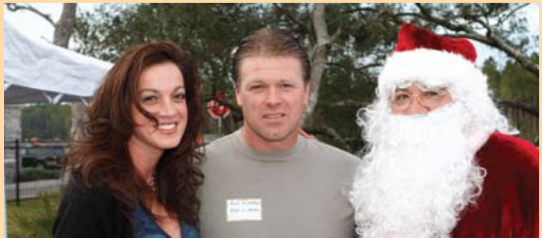
Chamber guests enjoyed the holiday mixer.