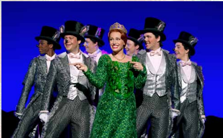
Broadway Across America presents "Shrek, the Musical" April 26-May 1 at The Fox Theatre. Tickets are available at Ticketmaster.com or by calling 800-745-3000.

2011 - Philips Arena, 7:00 p.m., $59.75-$125.75, T.